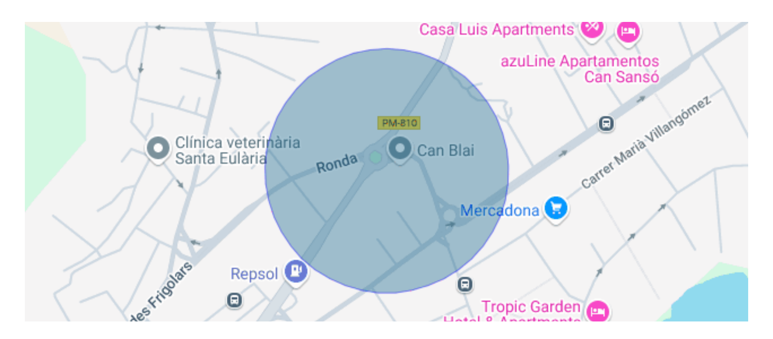
Santa Eulària des Riu / Santa Eulalia del Rio